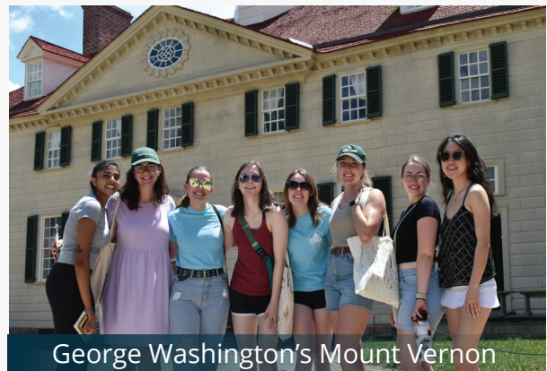
George Washington's Mount Vernon