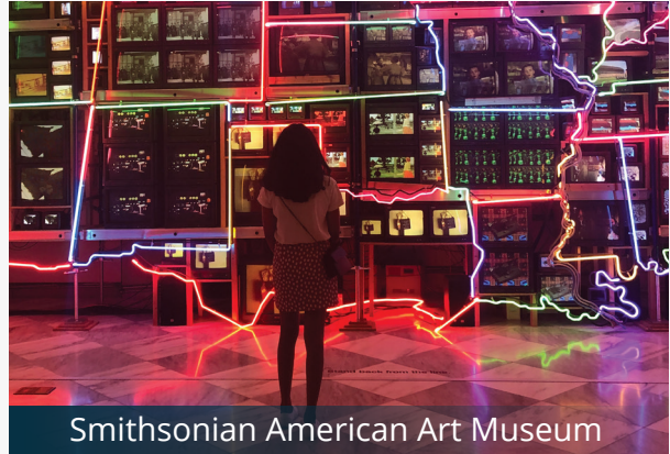
Smithsonian American Art Museum